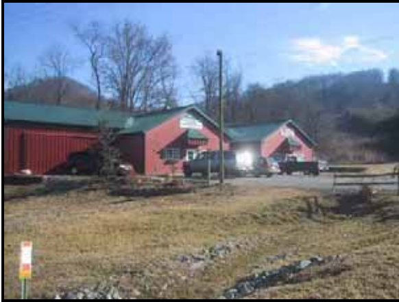
Building Front (NE)