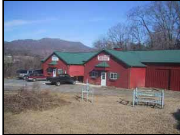
Building Front (NW)