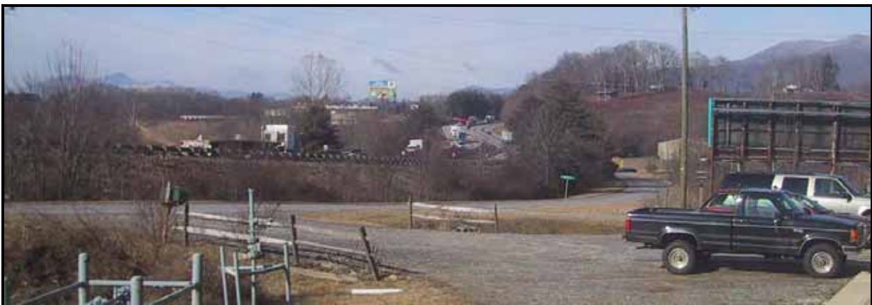
Interstate 40 Exposure